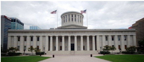
NAIFA-Ohio Capital Conference and Day-at-the-Statehouse March 7, 2018 - Columbus, OH